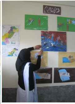
A student of FG College F-7/2 decorating the class room