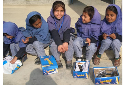
Everyone gets new school shoes today

With the grace of Allah all children got shoes and sweaters before the