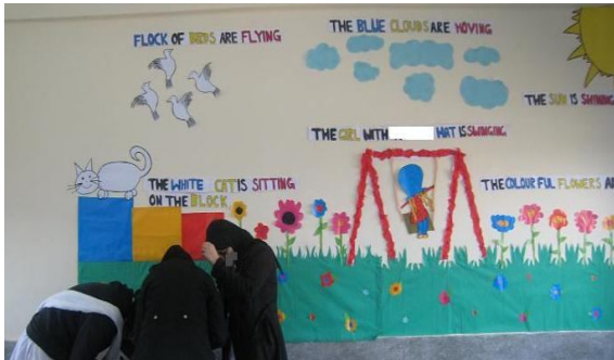
Students finishing up their work

On 18th Feb the class visited again to setup the class and complete the project. Within two hours they class completed the task at hand. The class has been decorated while keeping in mind the level of the children as well as making it colorful and attractive.