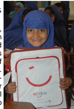
Class 1 student: All smiles

An internet providing company, Wi-tribe came to OSC School on 2nd March 2010 and distributed bags to the children. There was excitement seen on the faces of children while getting new bags. The bags have been made by recycling penne flex banners used for advertisements. The company shall be providing free internet facility to the school as well.